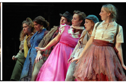
To apply, visit tdps.umd.edu